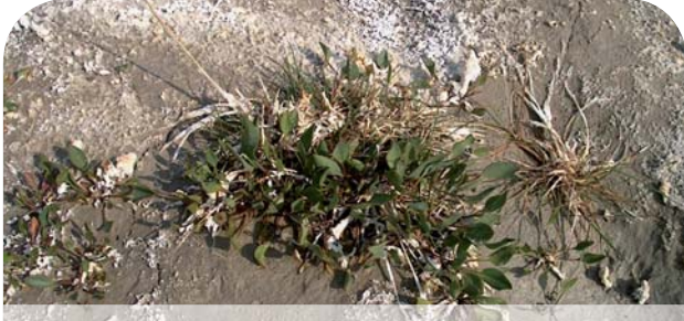
Only certain salt-tolerant plants can survive in these conditions.

Salinisation , the accumulation of water-soluble salts in soil, is like a form of poisoning. The result of inappropriate irrigation or the excessive extraction of groundwater in coastal areas, it can push bacterial species into a dormant phase, and kill other soil organisms. The result is a decrease in plant growth and crop productivity, and an increased risk of desertification.