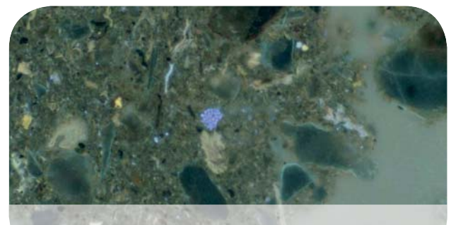
Bacteria can double their numbers in minutes.

Bacteria live in the water-filled pores in soil. They reproduce rapidly and can double their population in minutes. But they can also enter a dormant stage and come back to life after a period of years. Their Prince Charming may come in the guise of a plant root, pushing them into a fertile new environment, or an earthworm, whose gut provides the ideal conditions to reawaken them. Fungi comprise an eclectic group that vary from singlecelled yeasts to complex structures visible to the naked eye, as in the case of mould on fruit. They inhabit the spaces around soil particles, roots and rocks. Some species recycle dead or decaying organic matter, while others break up sugars, starches and cellulose in wood.