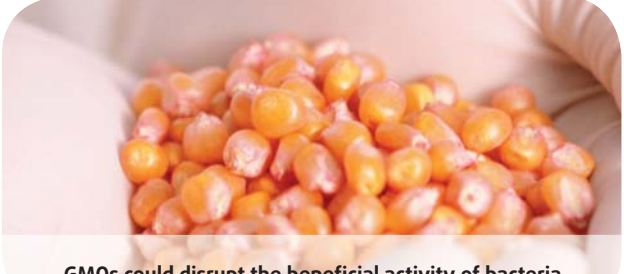
GMOs could disrupt the beneficial activity of bacteria.

Yet while evidence of soil degeneration has been apparent for some time, we are still standing by, watching the soil factory fail