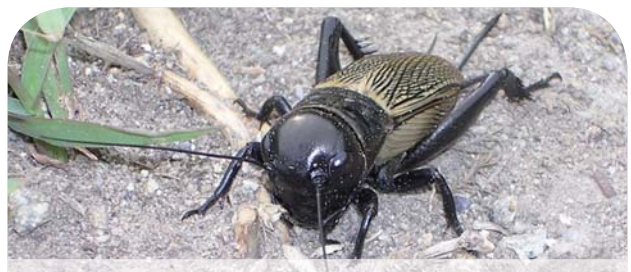
The male field cricket ( Gryllus campestris ) builds a burrow up to 30cm deep.

The work of the factory may never have been more important than it is today. As the global population heads towards nine billion by mid-century, healthy soils will be critical to our future food supply – all the more so given the growing pressures on land, for urban expansion, biofuels production and natural resources extraction, as well as the ongoing land degradation due to organic matter loss, erosion, desertification and other causes.